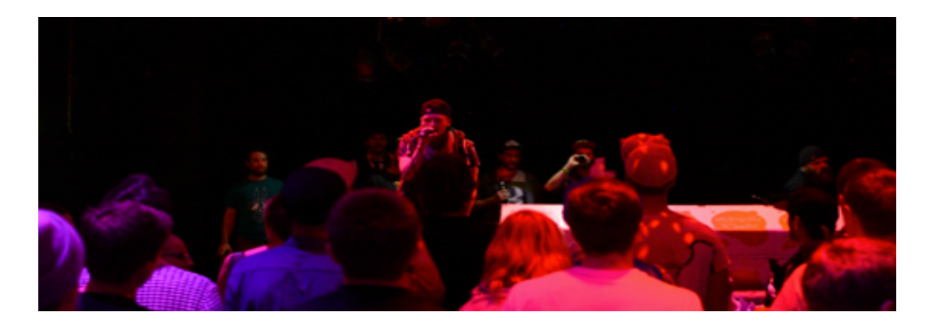
"Life is Hard" now has more than 13,000 views on YouTube. What did you feel?

It is an incredible feeling when you hear your own song on the phones of others or in the car. My father always download the latest video from me to his mobile phone to show it to friends and relatives. My family supports me a lot.